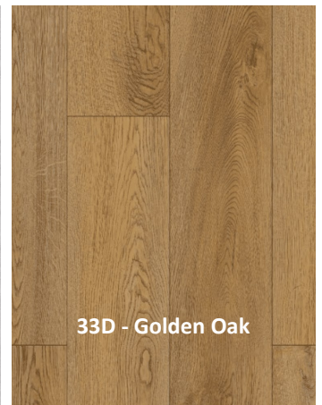
33D - Golden Oak