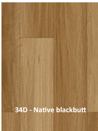
34D - Native blackbutt