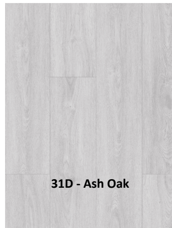
31D - Ash Oak