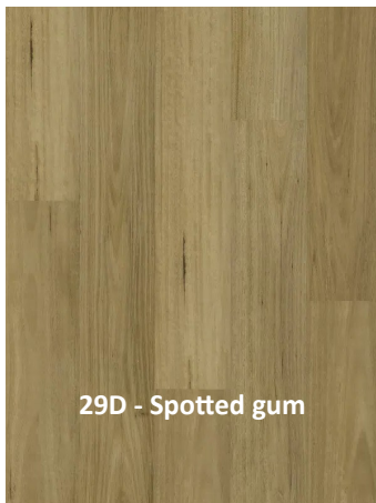
29D - Spotted gum