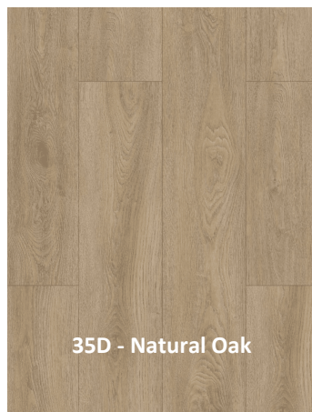
35D - Natural Oak