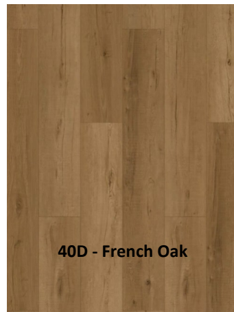
40D - French Oak