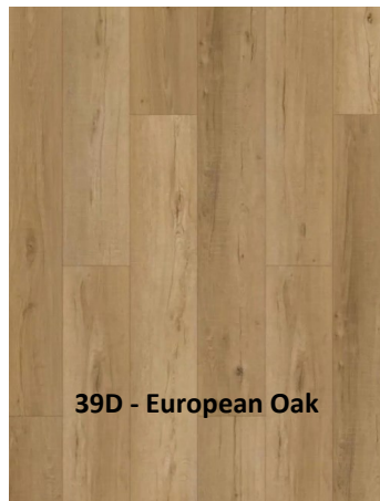
39D - European Oak