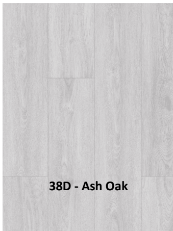
38D - Ash Oak