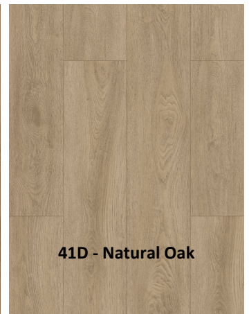
41D - Natural Oak