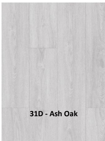
31D - Ash Oak