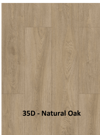
35D - Natural Oak