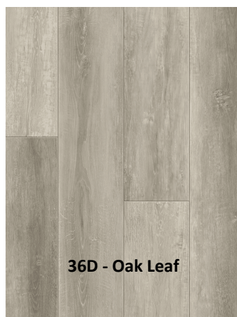
36D - Oak Leaf