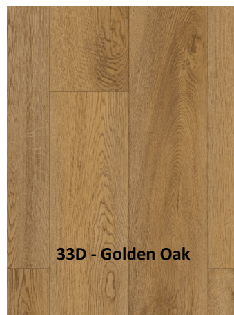
33D - Golden Oak