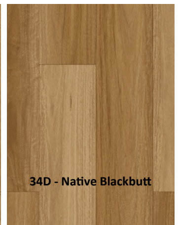
34D - Native Blackbutt