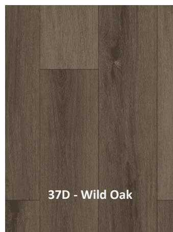
37D - Wild Oak