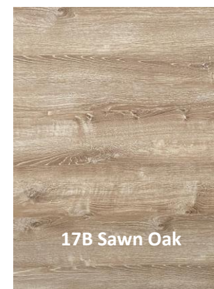
17B Sawn Oak